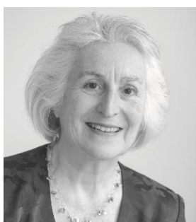
Prof. Catherine Kessedjian

In this role, he worked with a wide range of U.S. companies helping them achieve their international objectives and with foreign governments on the development and implementation of trade and investment policies. He also co-led the creation of SelectUSA, the U.S. government's investment attraction agency, led the U.S. government's support for BrandUSA, the U.S. national tourism promotion organization, and co-led the development of the U.S. National Travel and Tourism Strategy.