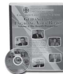
SCCE's board training video, Guidance for Engaging Your Board (normally $395)